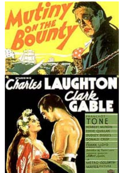
A poster from a 1935 Hollywood production.

Prospective scriptwriters and producers looking for a story consultant are encouraged to contact the Museum.