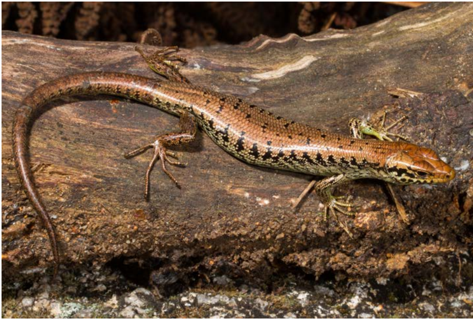
FIG. 1. Eulamprus frerei (QMJ92282) collected from Mt Lewis, North Queensland.

molecular data (CJH unpublished data). The specimen is now lodged at the Queensland Museum (QMJ92282).