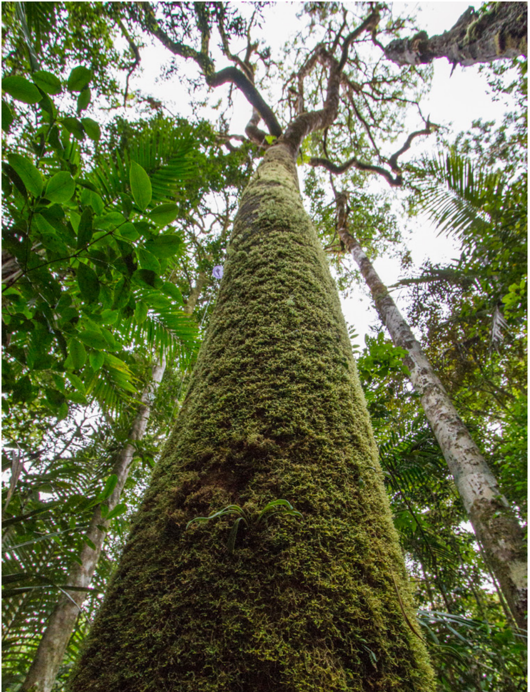
FIG. 3. The tree on Mt Lewis from which QMJ92282 was captured.