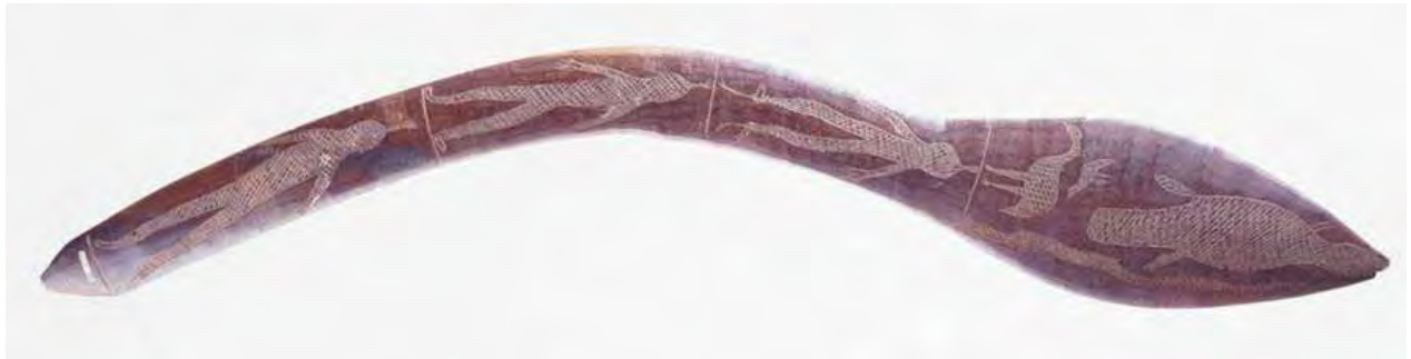
Carved Club Boomerang.