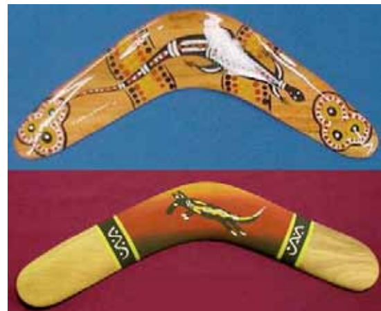
Modern tourist boomerangs.

When purchasing a boomerang with Aboriginal designs, it is important to consider buying only from reputable Aboriginal craftsmen or approved outlets, and to respect the cultural origins of this remarkable artifact.