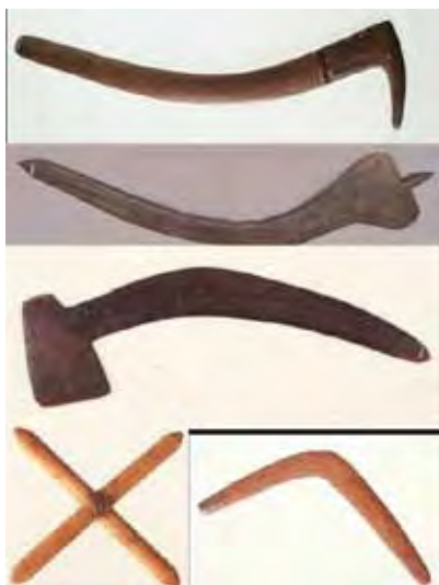
Different types of boomerangs.

A common misconception is that all boomerangs are returning types. In fact most of the Aboriginal hunting and war boomerangs are designed to travel only in the direction thrown. Non-returning varieties are larger and heavier than the returning ones and have a distinctive hook shape. Returning boomerangs are generally 30–75 cm long and have a greater curve in relation to their length. The arms are slightly twisted to produce the aerodynamics of returning flight. Their aerofoil shape, where the bottom surface is flat while the top is curved, also aids in flight.