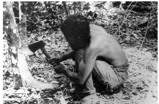
A boomerang being cut from a tree root.

Traditionally, decorations on boomerangs are produced by carving, burning or painting. Others are clan designs, which only a few related people are allowed to use as they may identify them or demonstrate ownership of land. When used ceremonially, the designs often relate to the ceremony in which the boomerangs are used.