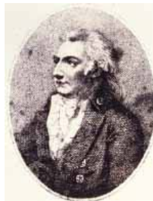
Engraving of George Hamilton from the frontispiece of his published narrative ( Voyage round the world in HMS Pandora , Berwick, 1793).

Three walls of Surgeon Hamilton's cabin were made of light wooden panels, one of which had a door with some glass panes. The fourth was the side of the ship. Very little natural light filtered down from the upper deck. Hamilton had to work by lantern or candlelight to prepare his medicines or write in his journal.