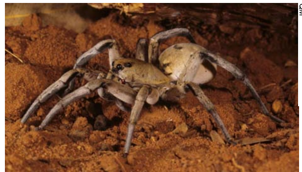
Figure 5. Wolf Spider ( Lycosa sp.)

Wolf Spiders (Figure 5) are occasionally mistaken for Funnel-web Spiders because they are frequently found in burrows and roaming about at night. These spiders do not belong to the Mygalomorph group, and possess fangs that face inwards toward each other rather than projecting downwards. They are also usually brown and distinctly patterned, and possess a large pair of forward-facing eyes, unlike Funnel-web Spiders who have small eyes, all of equal size and closely clustered together.