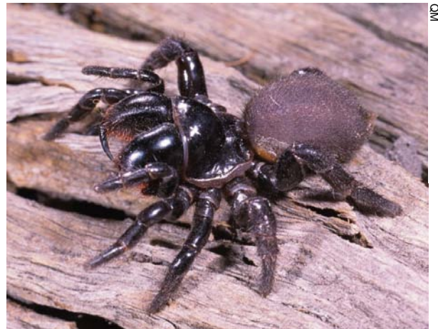
Figure 4. Mouse Spider ( Missulena sp.)

are, however, often smaller (usually only up to the size of a 50c piece) and have disproportionately large fangs. These large fangs are serviced by equally large muscles which result in a distinct step-up towards the front half of the cephalothorax; the cephalothorax of Funnel-web Spiders is much flatter.