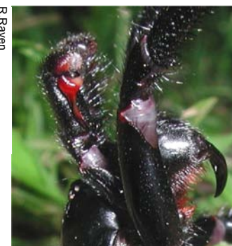
Figure 3. Close up of front of male showing tip of palp (red)

After mating, females return to their burrow to lay their eggs. It takes a few weeks for the eggs to hatch, often filling the burrow with over 100 hatchlings when they do. Soon after, the young spiderlings leave the maternal burrow to build nests nearby and begin a life of their own. After five to seven years, surviving offspring reach sexual maturity and begin mating themselves. Adult females can live for up to 20 years.