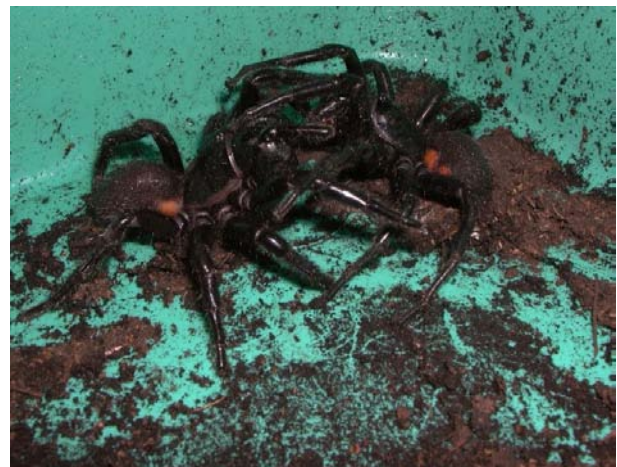
Figure 2. Mating Funnel-web Spiders

Like other spiders, male Funnel-web Spiders carry their sperm packet in the bulbous tips of their palps, the forward-most pair of leg-like appendages situated on either side of the fangs (Figure 3). Once mating is complete, the male is either killed by the female as he attempts to retreat, or he dies soon after.